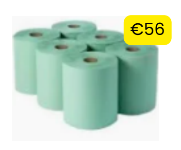
Green paper 6pack