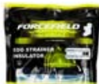
Egg insulators 10pck