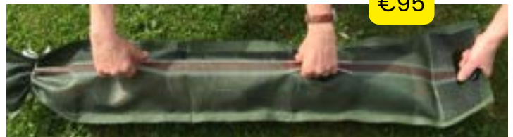
Silage Bags 50 pack