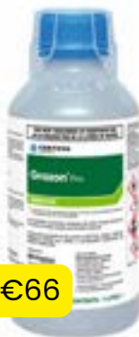
GRAZON PRO 1LTR