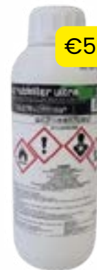
SCRUBKILLER ULTRA 1LTR