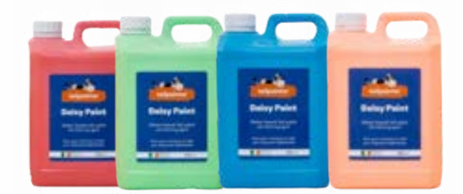
Dasiy paint for the Tail Painter