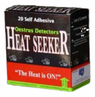
Available in Red & Blue

Heat detection methods can vary from farm to farm, but the goal remains the same, to stay in control of the breeding season and minimise missed heats. Buyrite Solutions offers a range of reliable heat detection aids to suit every system. Here are your options: