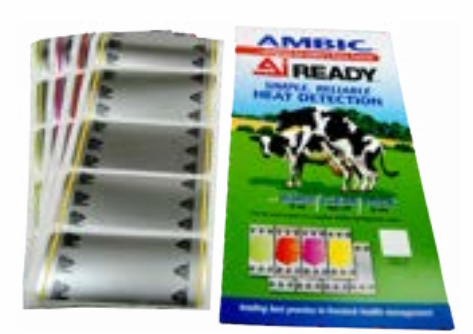
Available in Red , Green & Yellow