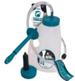
TRUSTI CALF FEEDER