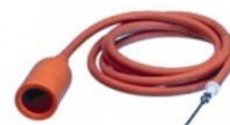
Flutter Valve kit