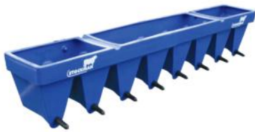
RANGE OF STOCKMAN CALF FEEDERS