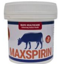
MAXSPIRIN - ANTI INFLAMMATORY / PAIN RELIEF