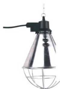
Infrared lamp & Bulb