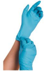
BUY 9 GET 1 FREE