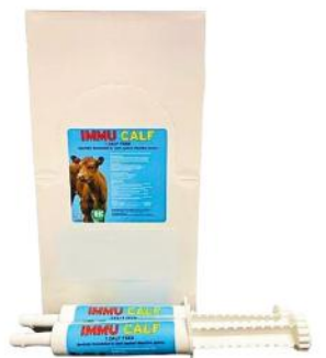
Immu Calf Syringe