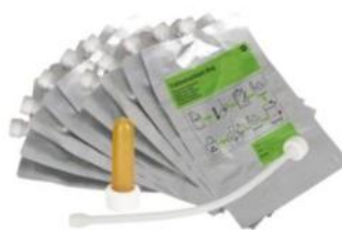
Colosrto Start (Set of 10)