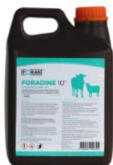
Iodine 500ML/ 2.5L