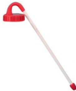
SPEEDY FEEDER DRENCHER