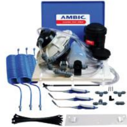
AMBIC TEAT SPRAY UNIT