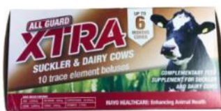
ALL GUARD XTRA