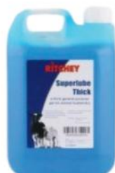
Lube Gel 2.5L/5L