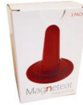
MAGNETIC TEAT STOP