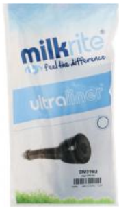
RANGE OF LINERS AVAILABLE