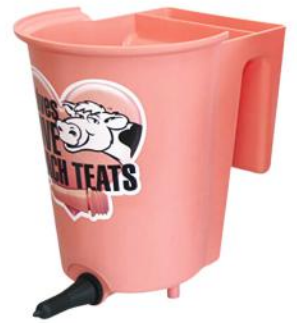
6LTR CALF FEEDER