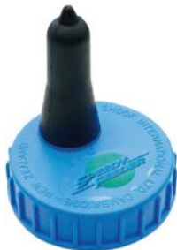
SHOOF TEAT LID