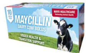
MAYCILLIN BOLUS - HIGH CELL COUNT