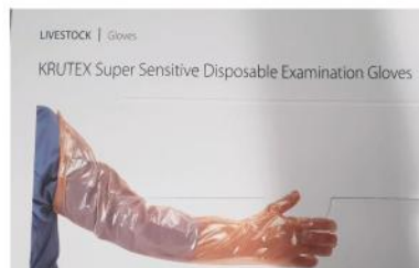
Arm Length Gloves