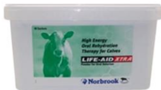
Life Aid Extra