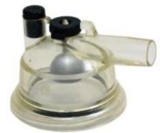
RANGE OF CLAW BOWLS AVAILABLE