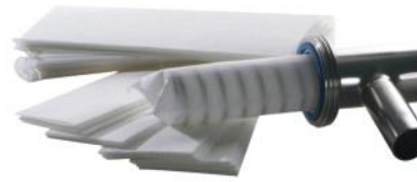
MILK FILTER SOCKS SUPER STRENGTH BONDED FIBRE