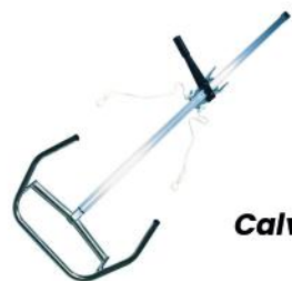
Calving Jack & Ropes