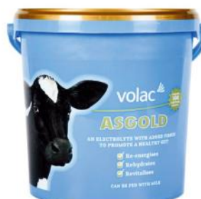
As Gold 5KG