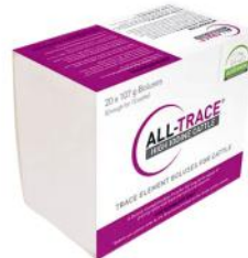
ALL TRACE HIGH IODINE