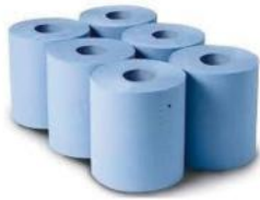
BLUE AND GREEN PAPER