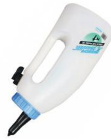
SPEEDY FEEDER 2.5Ltr