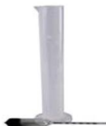
Colostrum Meter Quick way to measure the quality of Colostrum