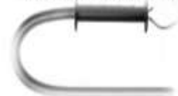
Gate handle & spring