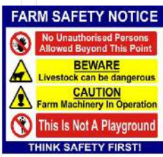
FARM SAFETY NOTICE 400 x 500