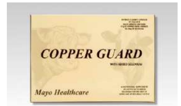
Copper Guard Bolus