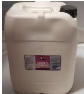
Iodine 20 Ltr