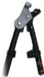
Grippler tool & 50 Gripplers