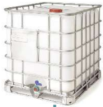
Magnesium Liquid with Full trace elements