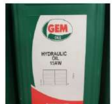
HYDRAULIC 15 OIL 20LTR