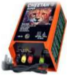
Fencers Battery & Mains 2.5 –30 Joules