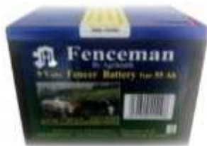
9V 130 amp battery