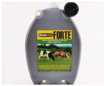
Growvite Forte 2.5 Ltr