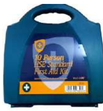
FIRST AID KIT (10 PERSON)