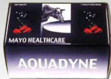
Aquadyne Tabs 200s