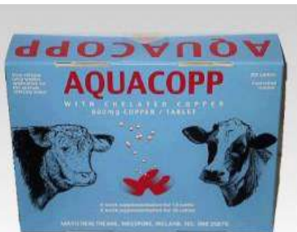
Aquacopp Tabs 200s