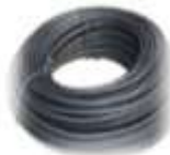
Underground Cable 1.6 mm x 25 m 1.6 mm x 50 m