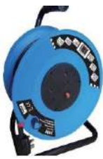
Extension Lead 220V