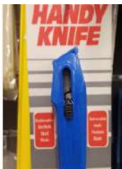
Blue Handy Knife