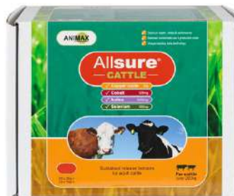
All sure Bolus