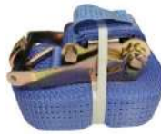
5 Tonne Lashing Strap & Ratchet 8m