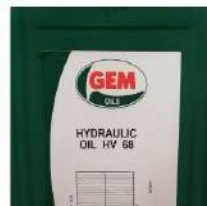
HV68 MILKING MACHINE OIL