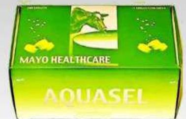
Aquasel Tabs 200s