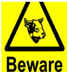
BEWARE OF THE BULL SIGN