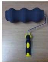
CORRUGATED ROLLER 9"