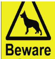
BEWARE OF DOG SIGN