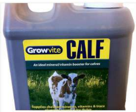
Growvite Calf 1 Ltr