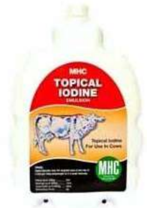
Topical Iodine Pour On