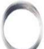
High Intense Wire