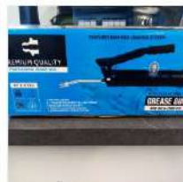
Grease Gun 400g