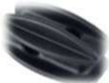
6 pk Egg Insulators