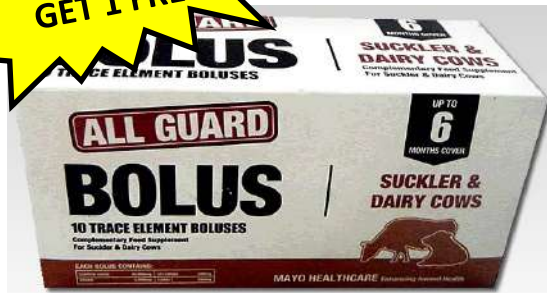
All Guard Bolus

Contains Iodine, Selenium, Cobalt and Copper