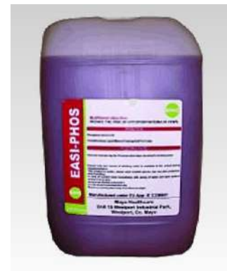
Easi Phos 25Ltr

Call into our Farm Store. Old Dublin Road, Enniscorthy.