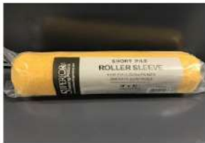
9" Short Pile Roller Sleeve