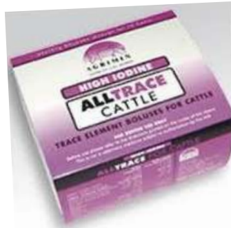
AllTrace Hi Iodine

Contains Iodine, Selenium, Cobalt and Copper