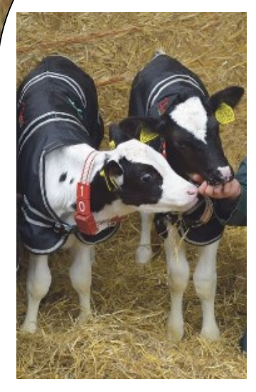
New Calf Jacket