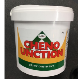
Cheno Unction 2kg